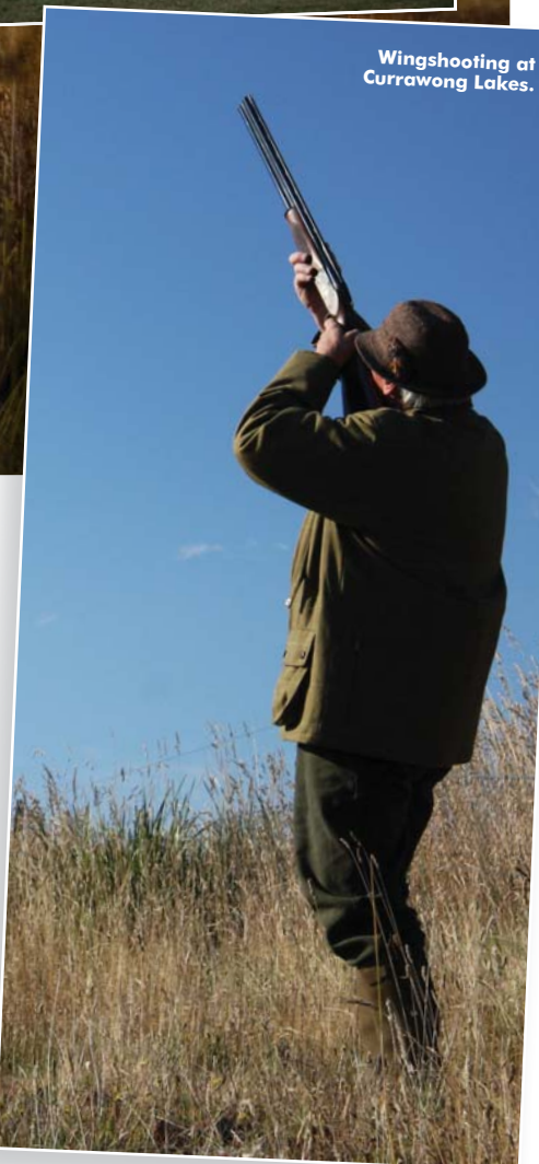
Wingshooting at Currawong Lakes.