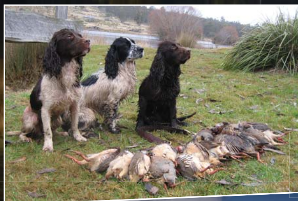
Trained spaniels at Currawong Lakes add to the experience.