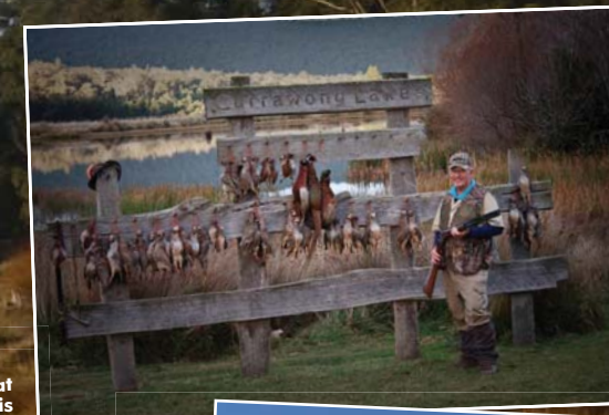
Wingshooting at Currawong Lakes is both challenging and enjoyable.