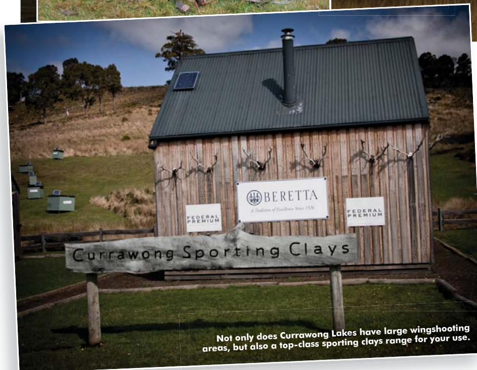
Not only does Currawong Lakes have large wingshooting areas, but also a top-class sporting clays range for your use.

B eretta Australia and Currawong Lakes have combined to showcase the world-renowned firearms of Beretta with Tasmania's exceptional and professionally managed wingshooting destination, Currawong Lakes.